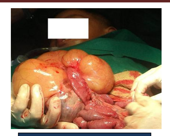
Intraoperative pic of the Enterogenous cyst.